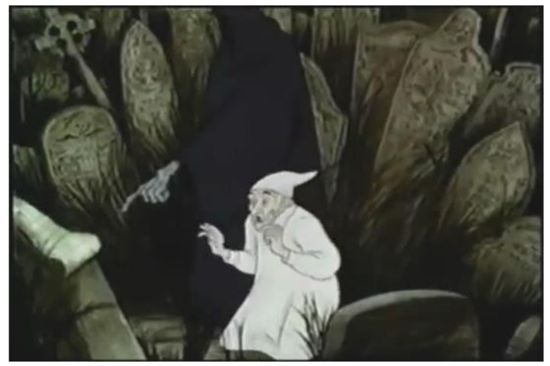
Scrooge was horrified. He vowed to change his life immediately.